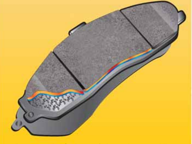
Recommended for import & domestic automobiles, Iuxury SUV's, sport trucks & vans.

Results based on A04D Dyno tests using D52 automotive platform. Actual on-vehicle performance may vary.